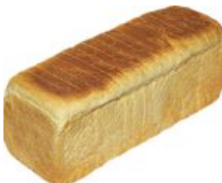
Why To STOP Eating Whole Wheat Bread, Vegetable Oils & These ... The Fat Burning Kitchen Guide Book