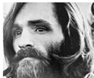
Is That What the Song "American Pie" Is Really About? Mediander