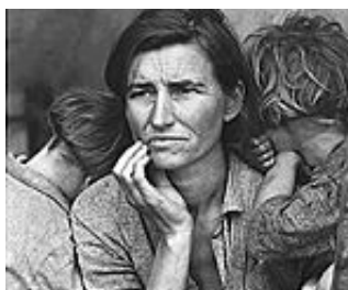
'Warren Buffett Indicator' Signals Collapse in Stock Market Newsmax