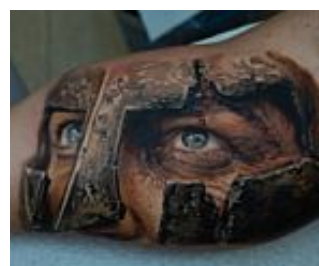
Some Amazing Tattoos For Change (32 Photos) Weblyest