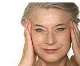
The WORST Food that CAUSES Aging Women's Life Today