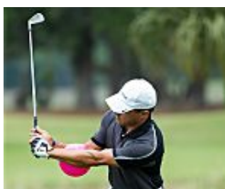
The #1 Reason the Average Golfer Can't Hit It 200+ Yards... Revolution Golf