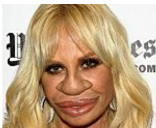
Top 10 Richest Women in the World LikeShareTweet