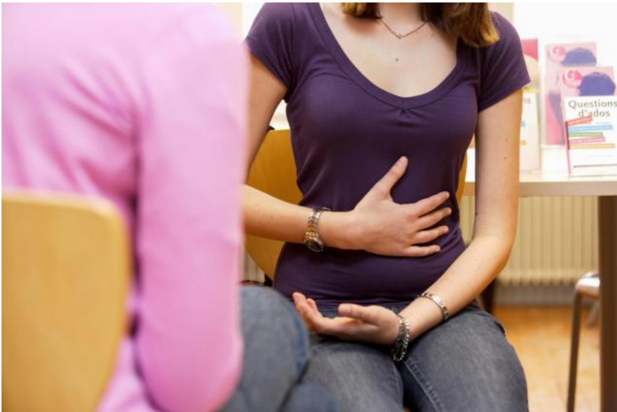
Medics have called for abortion to be decriminalised