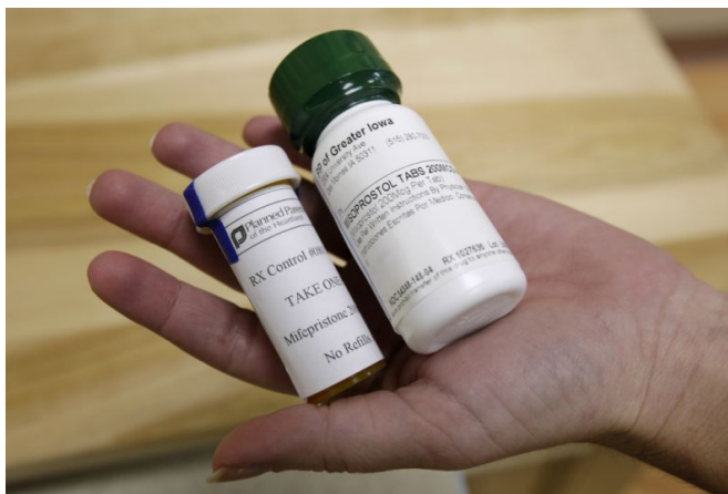
FILE - This Sept. 22, 2010 file photo shows bottles of the abortion-inducing drug RU-486 in Des Moines, Iowa. A new study published Tuesday, May 16, 2017 shows medical abortions done at home with online help and pills sent by More

LONDON (AP) — Medical abortions done at home with online help and pills sent in the mail appear to be just as safe as those done at a clinic, according to a new study.