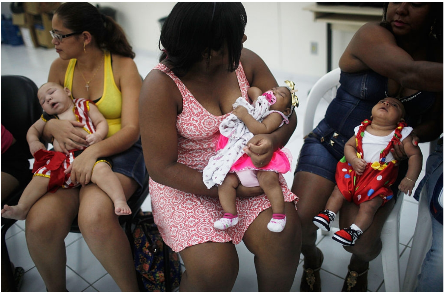
Babies dressed in Carnival outfits, born with microcephaly, are held by their mothers at a Carnival party held for babies with the condition in a health clinic on February 4, 2016 in Recife, Pernambuco state, Brazil.

Women in Brazil and in several countries affected by the spread of the Zika virus are being told not to get pregnant for fear that the virus causes microcephaly, a birth defect in which children are born with undersized heads.