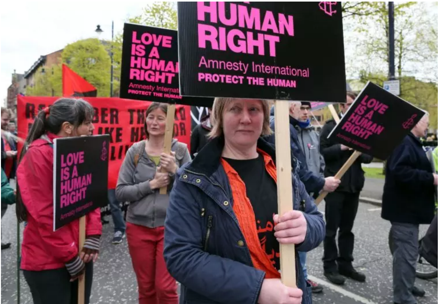
Pro-choice campaigners take part in a demonstration through Belfast city centre on April 30, 2016.

But the bpas suggests only buying abortion pills from reputable, not-for-profit sites such as Women Help Women and Women on Web .