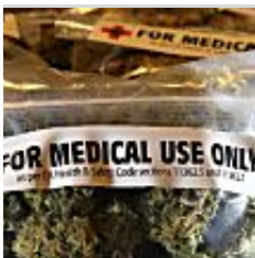
Medical marijuana legalized in Australia