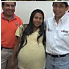
35-pound tumor removed from Peruvian woman