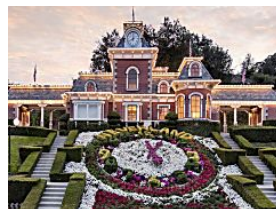
Michael Jackson's 'Neverland' Estate Courts Chinese Buyers Mansion Global by Dow Jones