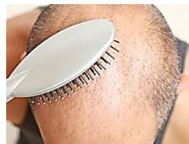
Unique Method May Regrow Lost Hair Lifestyle Journal

MB Public urged to be alert vs Zika virus