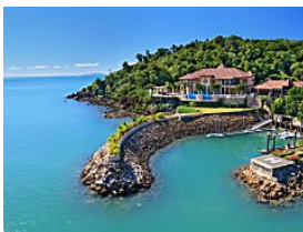
See Mansion Global's 2015 Listing of the Year Mansion Global by Dow Jones